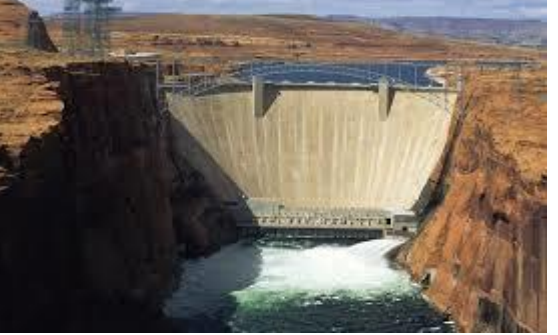
Glen Canyon Dam on the Colorado River.

It is obvious that as long as the dam remains rock solid, strong, fixed, and impervious, then the water