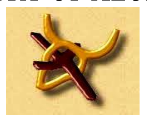
Rev 1:8 in Ancient Hebrew: The Aleph - Tau