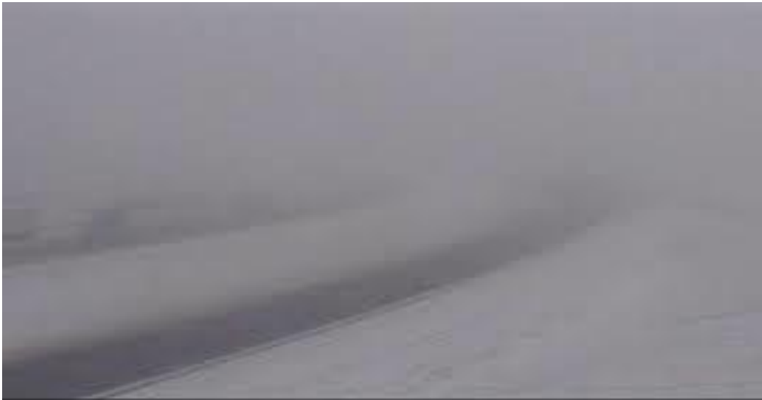
General Picture of a Montana Snowstorm describing the scene and identical to the storm that we were in.

This was beyond bizarre! We were experiencing the extension of the arm of arm of YAHUWAH once again [Isa 53:1; 40:4-8; 1 Pet 1:25; others] and in a manner that we had not encountered before; this experience being another testament to our personal journey with YAHUWAH [Jer 29:11-14; Heb 11:6, 1; Psalm 50:1-13; Rev 12:11; others].