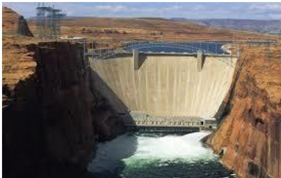
Glen Canyon Dam on the Colorado River.

The carnal nature and its corresponding impact on the environment of mixture in which an individual may be ensnared in, is analogous to a huge dam holding back an even bigger reservoir of water.