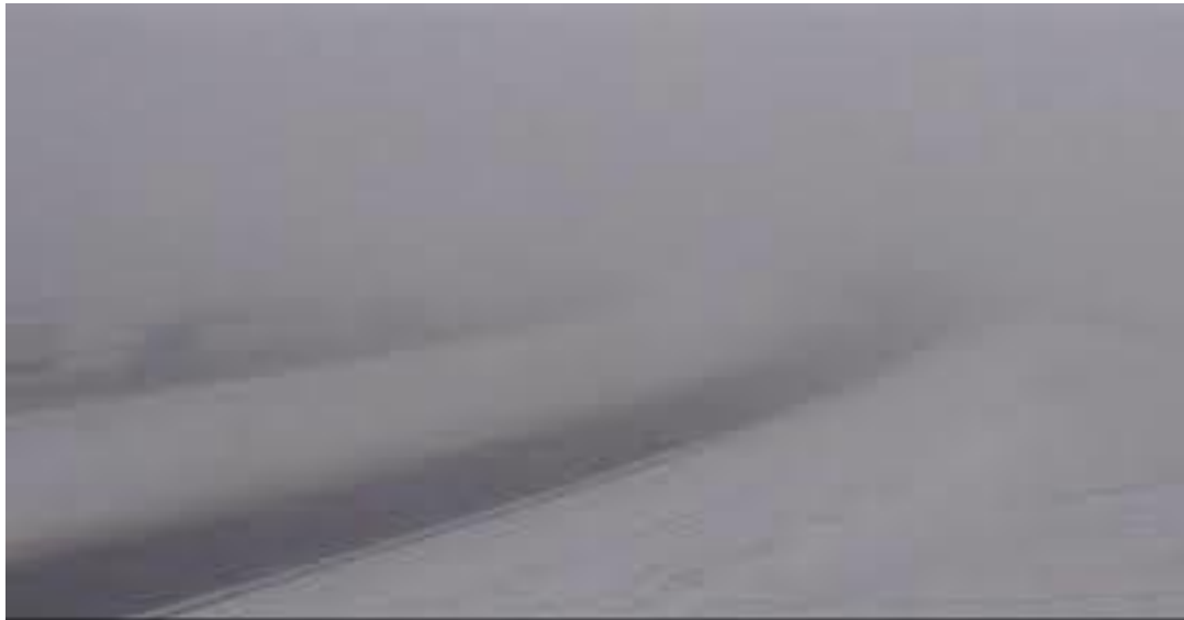
General Picture of a Montana Snowstorm describing the scene and identical to the storm that we were in.

This was beyond bizarre! We were experiencing the extension of the arm of arm of YAHUWAH once again [Isa 53:1; 40:4-8; 1 Pet 1:25; others] and in a manner that we had not encountered before; this experience being another testament to our personal journey with YAHUWAH [Jer 29:11-14; Heb 11:6, 1; Psalm 50:1-13; Rev 12:11; others].