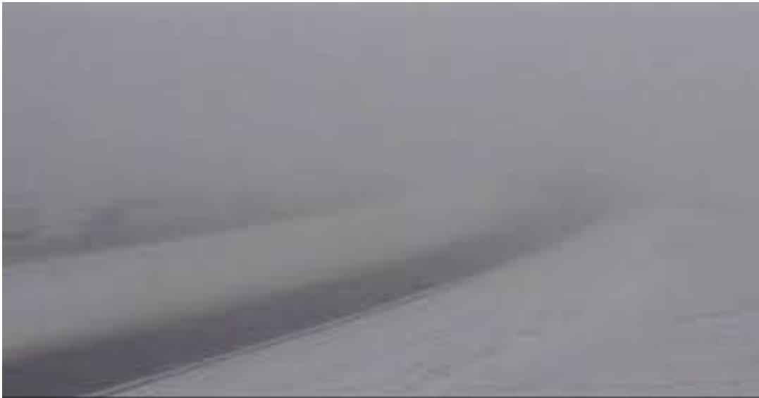
General Picture of a Montana Snowstorm describing the scene and identical to the storm that we were in.

This was beyond bizarre! We were experiencing the extension of the arm of arm of YAHUWAH once again [Isa 53:1; 40:4-8; 1 Pet 1:25; others] and in a manner that we had not encountered before; this experience being another testament to our personal journey with YAHUWAH [Jer 29:11-14; Heb 11:6, 1; Psalm 50:1-13; Rev 12:11; others].