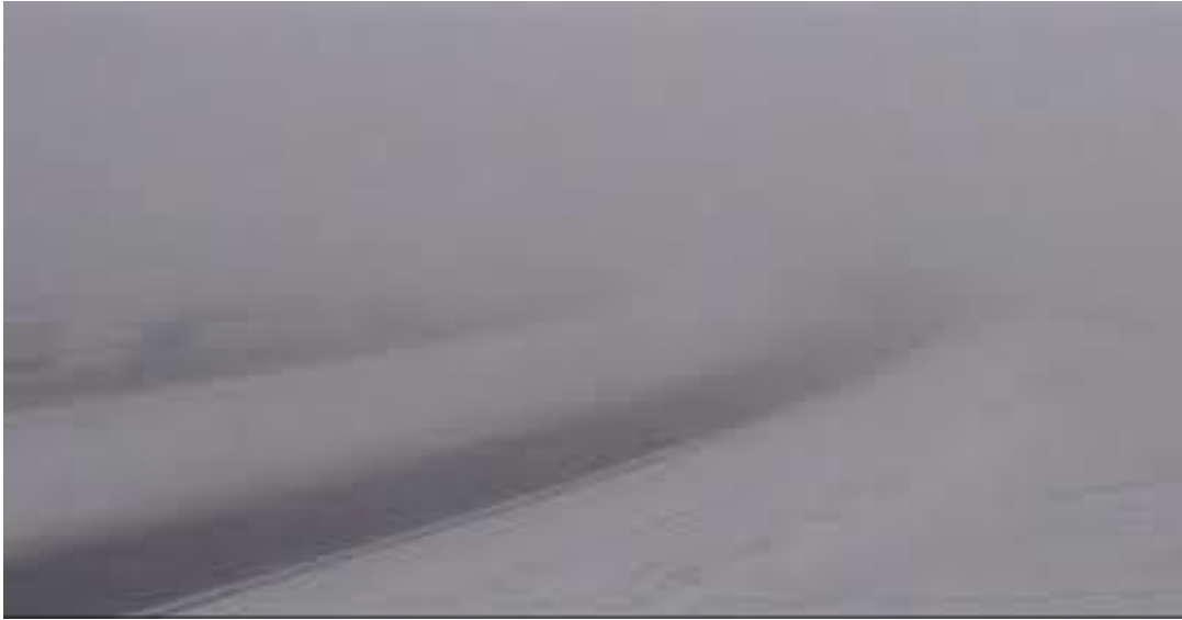
General Picture of a Montana Snowstorm describing the scene and identical to the storm that we were in.

before; this experience being another testament to our personal journey with YAHUWAH [Jer 29:11-14; Heb 11:6, 1; Psalm 50:1-13; Rev 12:11; others].